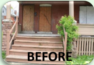
City Owned Property

Rock the Block's Economic Impact Value exceeded the project cost by $74,100