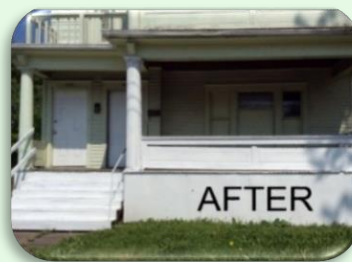
City Owned Property