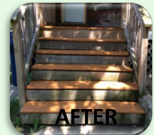
Resident Owned Property