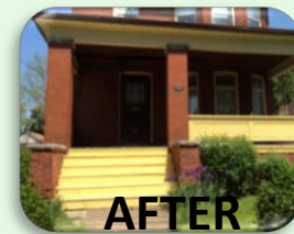
Resident Owned Property